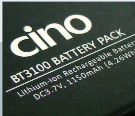
Efficient Power Management

Thanks to the special designed mounting holes, the smart cradle can be flexibly linked together to form a multi-slot cradle by a small hard plate. You can get an instant multi-slot cradle solution without any extra investment and effort.