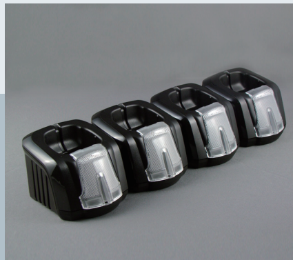
Multi-slot Cradle Solution