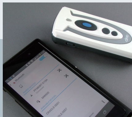
Bluetooth v 4.0 Technology

Cino Bluetooth pocket scanner can work with non-Bluetooth hosts, such as traditional desk top computer, through smart cradle in PAIR mode or PICO mode. This provides an instant plug-and-play cordless migration solution. In PICO mode, one smart cradle supports up to 7 scanners simultaneously. This can reduce the total IT infrastructure cost.