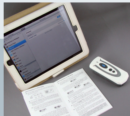
Several Radio Link Modes