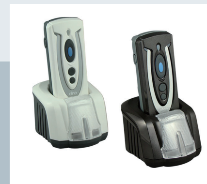
Smart Cradle Solution