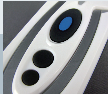
User-friendly Function Keys

The Cino Bluetooth pocket scanner is equipped with one big trigger button and two function buttons. These four function buttons allow you to enter power-off, sleep mode quickly without scanning the command barcodes. For example, when you use the scanner to work with iOS device, you can switch between barcode scanning and iOS device's on-screen keyboard quickly by pressing the function button twice. The friendly usability allows you to switch to different operations easily.