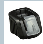
Smart Cradle Charging Cradle