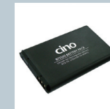
Battery: 1150mAh 2300mAh