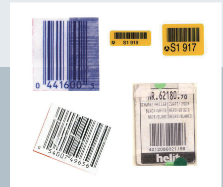
No Worry for Poor Barcodes

Thanks to FuzzyScan 3.0 imaging technology, Cino Bluetooth pocket scanner is capable of reading low contrast, damaged, smudged, poorly-printed and laminated barcodes that are commonly found in the real world quickly and accurately. To meet the emerging mobile commerce application, it can read paper-based and electronic bar codes shown on LCD screen. This makes the whole scanning process more efficiently and extra handling cost will be minimized.