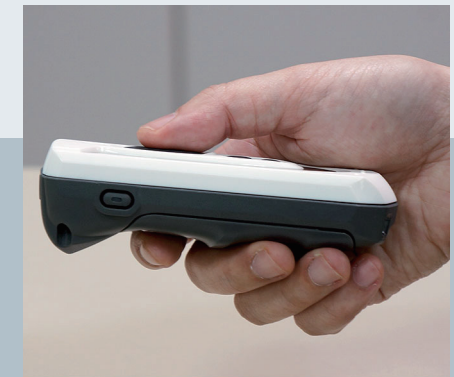
Ergonomic Outer Shell