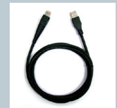
Cable: USB PS/2 RS232 Micro USB