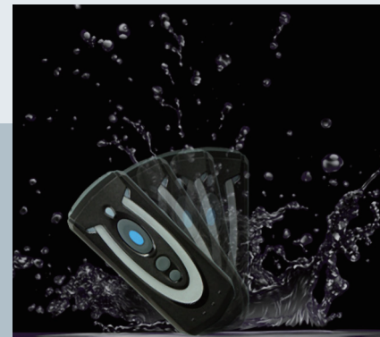
Rugged and Durable