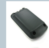
Battery Cover: 1150mAh 2300mAh